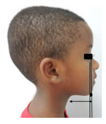
Figure 6: 9-year-old patient with increased chin-cervical distance

The normal convexity of the profile in young children diminishes with growth. Its increase indicates a Class II shift, while its disappearance or the concavity of the profile indicates a Class III [1].