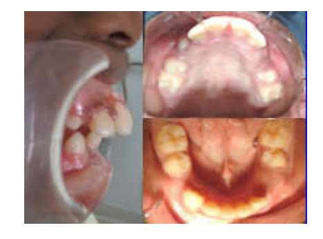
Figures 3-4-5 : Endo-buccal photographs of an 11-year-old patient with diminished chin-cervical distance (Source : Rakotoson M, 2018)

Figure 2: 11-year-old patient with diminished cervical-chin distance (Source : Rakotoson M, 2018)