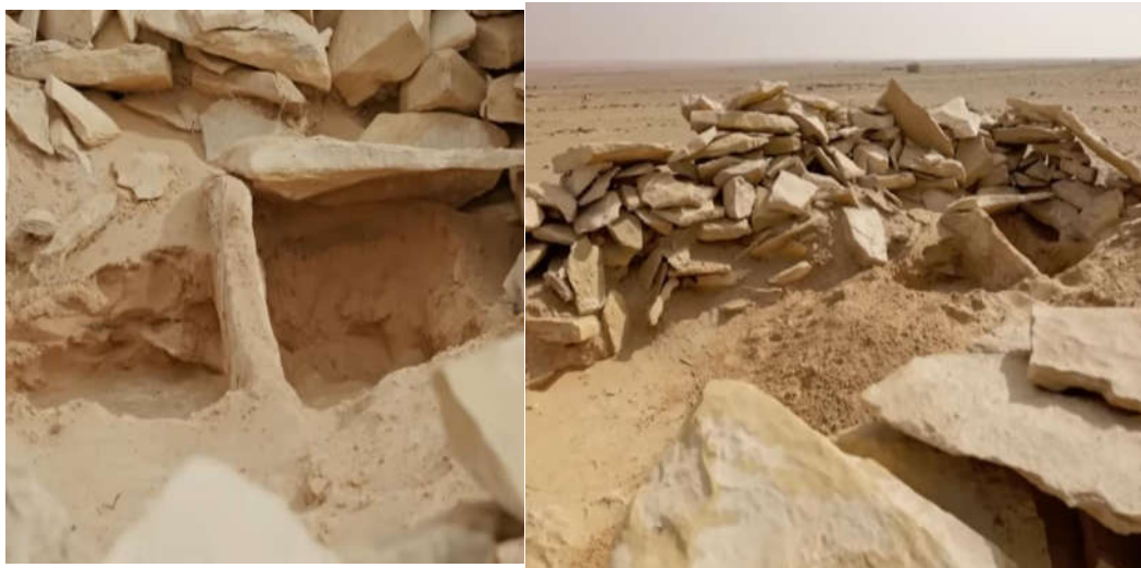
(Image -7-) A close-up image of the Mismary(nail-shaped) tomb showing smaller tombs at the Al-Mistawi site, captured by the 'On the Trail of the Arabs' team during the seventh season. The coordinates are as follows: 25°56'38.9"N 44°35'42.9"E.

As is well known, tombs vary from one individual to another based on social, religious, and relative wealth status. The degree of this variation affects the construction of the tomb. Moreover, tombs significantly differ over time and place. Regarding the nail-shaped tombs, it is likely that they were used for individuals of high stature, great wealth, and social and religious prominence. This is especially evident when we consider, for example, the model referred to as the 'Yellow Desert Level Tomb' in the Shamasiyah area northwest of Riyadh, with coordinates 25°56'38.9"N 44°35'42.9"E (see images -7- and -8-). In this tomb, the burial chamber for the prominent individual, likely of high social standing, is located at the head, with several smaller tombs on the sides.