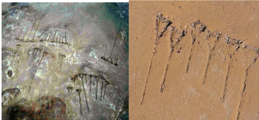
(Image -2-) Examples of the Mismary (nail-shaped) tomb style across the Arabian Peninsula, with the featured model taken from a site above the village of Al-Fao (Kingdom of Al-Fao) on the surface of Mount Tuwaiq, at the following coordinates: 19°46'53.1"N 45°10'45.4"E / 19°47'07.8"N 45°10'30.5"E. of Screw Burial Pattern in the Arabian Peninsula