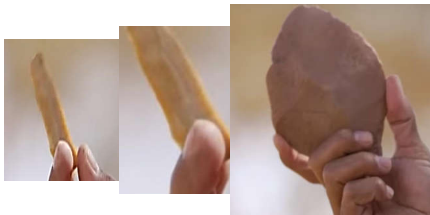
(Image -3-) Stone Scraper and Arrowhead discovered near one of the screw burials in the Rub' al Khali (Researcher Eid Al-Yahya)

screw, but they are similar in terms of the overall design. Specialists estimated the age of these burials to be around 8,000 BCE at the very least, especially for the burials discovered in the western part of the Rub' al Khali desert, where the initial desertification of the Arabian Peninsula began. The discovery of stone tools such as grinders, scrapers, and arrowheads near these burials (Image 3) suggests that they belong to the ancient Stone Age, which can be classified as the third stage of the Old Stone Age according to the renowned archaeologist Seton Lloyd. He considered the period between 30,000 and 12,000 years ago to be the stage that witnessed significant changes at the end of the Pleistocene epoch (Lloyd, 1993, p. 28). These traces were discovered more than a century ago in various parts of the Levant and northern Mesopotamia, while the Arabian Peninsula remained beyond the reach of explorers and excavators. Therefore, it is high time to study and uncover these sites in the Kingdom of Saudi Arabia, which are likely parallel to those eras in the Eastern countries, if not older.