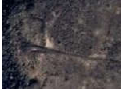
(Image -11.A-) The Asfīnī Tomb in Al-Hushrj, with the following coordinates: 20°57'36.8"N 41°36'47.8"E.

"Perhaps the clearest image of the Asfīnī tomb is the one discovered in the 'Al-Hushrj' area (refer to Image -11.A-) through aerial survey conducted by the researcher Eid Al-Yahya, with the following coordinates: 20°57'36.8"N 41°36'47.8"E. Another model is found in the city of 'Turabah' with the following coordinates: 21°05'01.2"N 41°39'00.6"E.