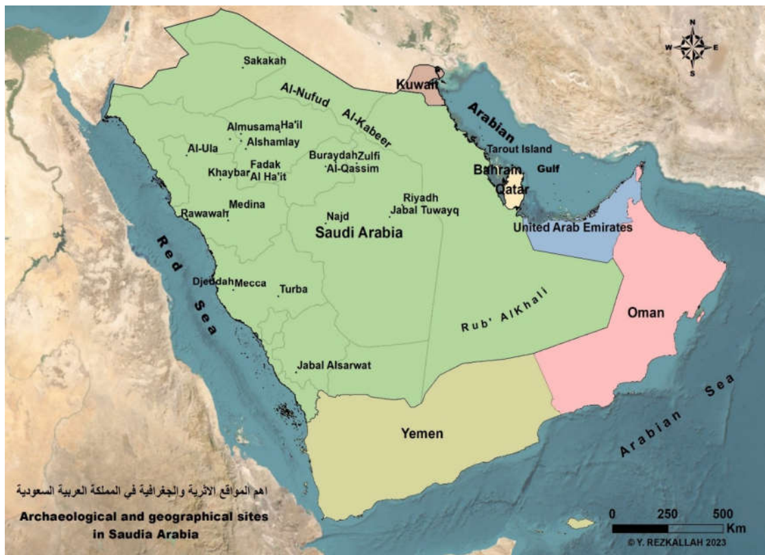
(Map-1-) Archaeological and geographical sites in Arabian Peninsula

The nail-shaped tomb style is spread over vast and diverse areas on the mountain surfaces, starting from northern Hadhramaut and reaching up to 'Al-Mustawi' and across the surfaces of most mountains. Among those that have been observed, there are immense numbers that extend from the south of Mount 'Tuwaiq', for instance, the following coordinates: (24°56'50.0"N 45°59'31.4"E). That majestic crescent-shaped mountain pierces through the Najd plateau in the heart of the Arabian Peninsula for over 800 kilometers until it meets the sands of the Empty Quarter desert, where it disappears buried under the sands. It continues to the northern ends of 'Tuwaiq', then into the 'Al-Mustawi' desert in Al-Qassim. This includes areas that are counted among them 'Al-Ghat, Al-Zulfi, and Al-Qassim', both to the north and south, east and west. (Refer to Map Number - 1-).