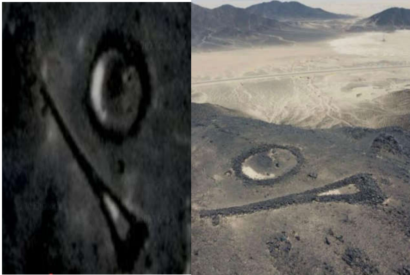
(Image -11-) The Asfini tomb next to the circular tomb on 'Farda Dalfaa' Mountain, approximately 50 kilometers east of the city of 'Ranyah', with the following coordinates: 21°08'04.1"N 43°12'42.9"E.