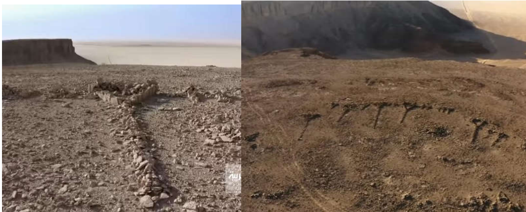
(Image -1-) Photographic images of various models of the Mismary (nail-shaped) tomb along with an image of one of the tombs from the ground, taken from a location on the edge of Mount Tuwaiq in Al-Ghat and above Al-Fao, with coordinates: 26°05'22.9"N 44°56'44.1"E / 19°47'09.2"N 45°10'30.3"E.

This Mismary (nail-shaped) symbol indicates, in terms of shape and design, the nail signs in the Mesopotamian writing system (cuneiform) and some writings of different neighboring civilizations from the languages of the Mesopotamian civilization. It is the shape and symbol that directly and accurately resembles the screw-shaped burial discovered in several areas in the Kingdom of Saudi Arabia and in other regions of the Arabian Peninsula (see Image 1, 2-).