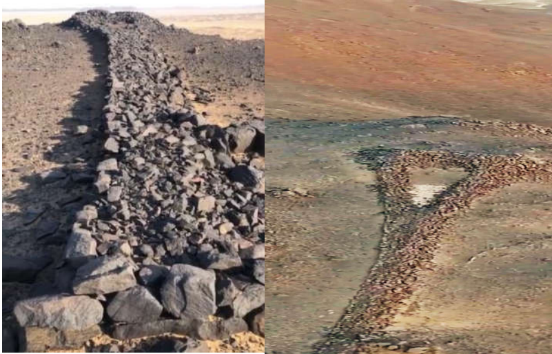
(Image -10-) Asfini tomb model atop 'Farda Dalfaa' Mountain, east of the 'Ranyah' Governorate, in the Makkah region, captured by 'Mr. Saad Abdullah HimeelQutnanAlsubaie's camera.

an enthusiast and amateur, took photographs of the tomb and measured its dimensions, which were as follows: 40 meters in length, from the end of the tail to the tip of the triangular head, and then 16 meters in length to its upper end. This makes the total length 56 meters. The width of the tomb at its head was 8 meters and 1 meter at the tail. According to the following coordinates: 21°08'05.2"N 43°12'43.6"E (Refer to Image -10&11-).